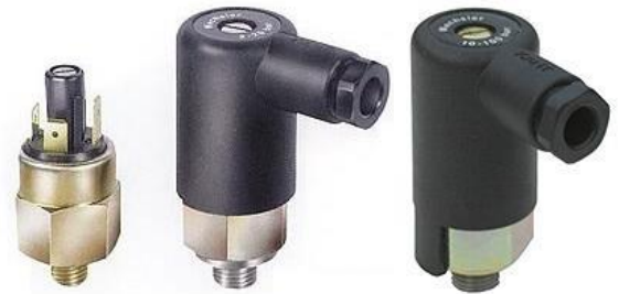
602 with device connector 600

Email: info@kant-druckschalter.de www.kant-druckschalter.de